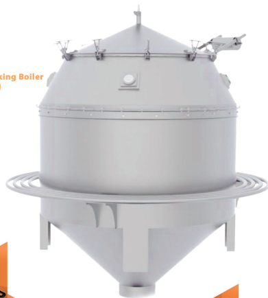
Cooking Boiler 2701