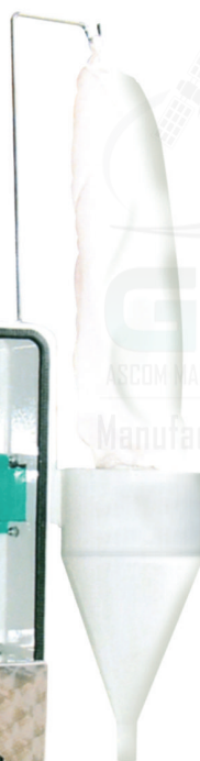
Paddy Quality GRM